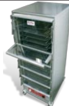
EP18/24 Donut Proofer (see page 80)