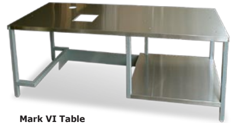
Mark VI Table

The FT-6 Mounting Table (left) secures the FT-6 Feed Table while allowing it to slide back while cake donut production is in progress. It is movable on heavy duty height-adjustable casters. The Mark VI Table supports and locks down the fryer, has holes for the fryer drain and EZ Melt refill tube, and is height adjustable. It houses the EZ Melt 34 shortening filter below the fryer. Both tables make efficient use of space with storage available for shortening blocks, glazing screens, proofing cloths and proofing trays.