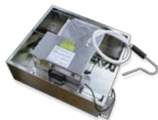
EZ Melt 34 Melter-Filter (see page 78)