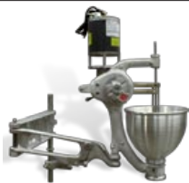
Type B or Type F Depositor (see page 74)