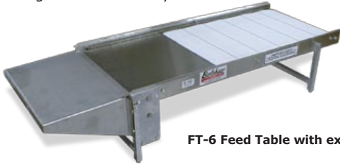
FT-6 Feed Table with extension

The FT-6 Feed Table accepts raised donuts from a proof box such as Belshaw's EP18/24. The donuts are laid on a Proofing Cloth and Proofing Tray to rise, then transferred onto the FT-6. The Feed Table advances in time with the fryer and drops the donuts into the fryer. The process allows the donut maker to move about rather than standing in front of the fryer.