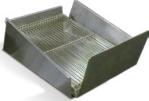
RL-18 Rack Loader