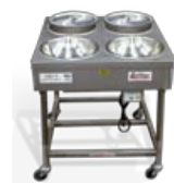
H+I Icers (see page 84)