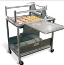
HG18/HG18EZ Glazers (see page 82)